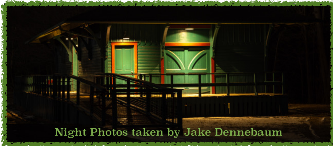
Night Photos taken by Jake Dennebaum