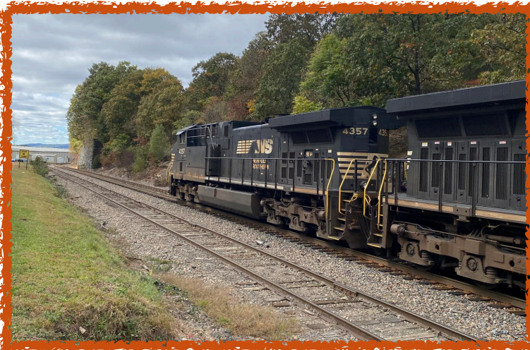
ABOVE: 11Z rolls through Yatesville. On the left is the old Eastern Trestle.