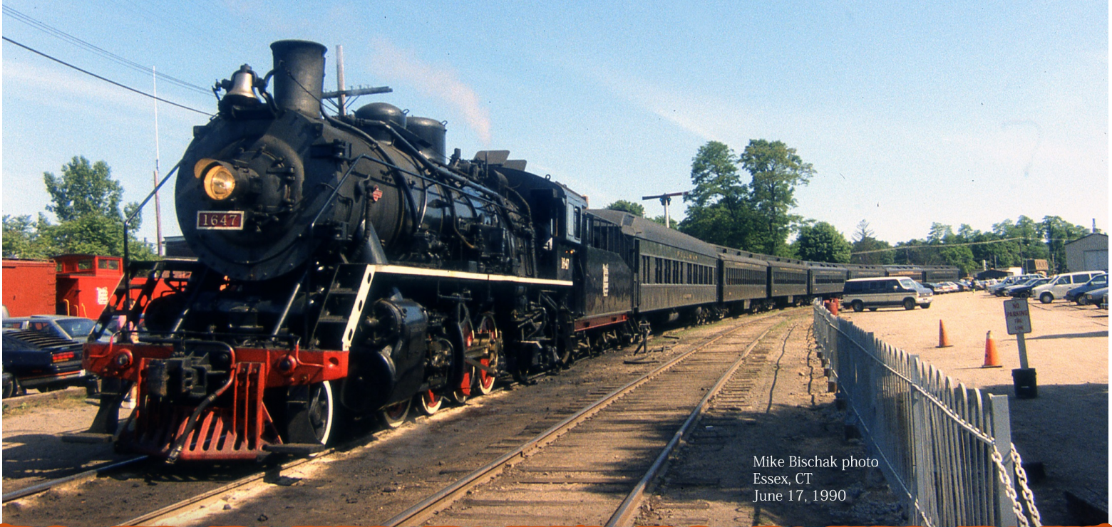
Essex, CT June 17, 1990

Valley's former 2-8-2 #1647 sitting in Essex Station, CT. The Chapter took a bus trip back in June of 1990 to the Valley Railroad. More on this on page 7.